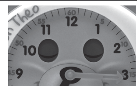
I close my eyes when